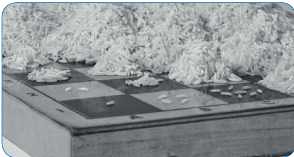
Figure 1: As an award for defeating the king in a game of chess, a sage asked for a grain of rice on the first square of the board and thereafter for the amount to double for every square. The king accepted, expecting this to be a small request. He soon found out that the amount of grains equals 210 billion tons.

As more precise medical imagery continues to become available, automatically an increase occurs in the mass of raw data produced as well as more demanding analysis. As simple mathematics demonstrate: If you have a picture increasing to the double in both dimensions, the number of pixels increase by a factor of four. If this quadrupled image data is shifted from 2D to 3D, each image layer adds the same amount of data. In the case of a video stream, the data rate will be multiplied by factor 50 to 60. But is this really as much as it sounds? Consider the saga of the grains of rice on a chess board, which demonstrates exponential growth: When starting with one grain of rice on the first square on a chess board and doubling the number on each following square, the total number exceeds 18 billion billion grains - or 18.446 * 10^{18} = 264 - 1 . Each of these multiplications means an exponentially larger amount of data. In the case of HD or even 4K resolutions, up to billions or even quadrillions of pixels have to be processed per